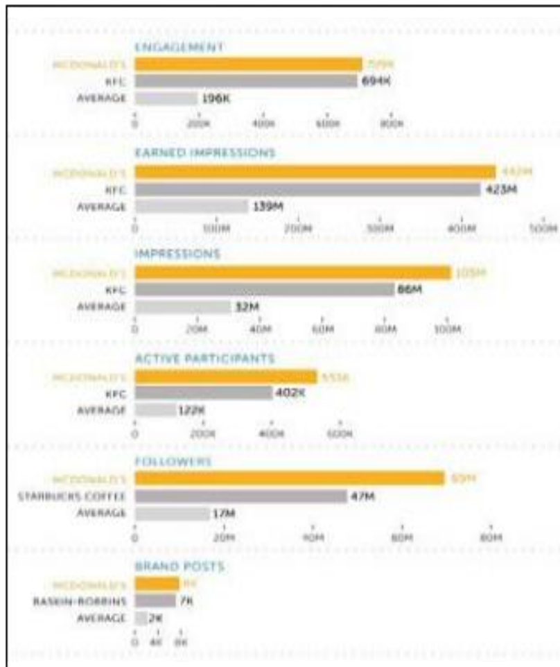
Source: Which Restaurants are winning on Social Media

McDonalds' decide how to signify to an combination of business firms within the food cheaper online massive has a near community. McDonalds grow to be the overall champion by means of coming to the internet connection settings, has a maximum intense kind of adherents and is likewise diagnosed for inclusion with clients. Since the on-line proximity, McDonalds is a worldwide image and features excellent impact as a commercial corporation and execution