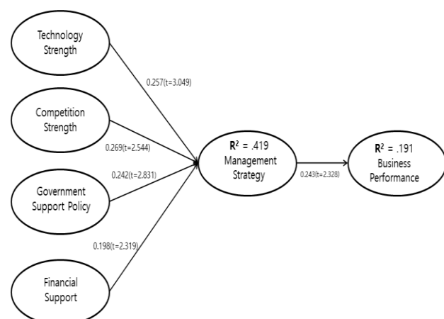
Fig. 2 Verification of Research Model

The hypothesis was verified using Smart PLS 2.0. The path factor and determinant ( R^2 ) values were derived. The goodness of fit can be indicated as "high" when the R^2 value is 0.26 or higher, as "moderate" when the R^2 value is 0.26–0.13, and as "low" when the R^2 value is 0.13 or lower (Cohen 1998). [Figure 2] presents the upper suitability of the determinant values in the management strategy (0.419), but the determinant values in the business performance (0.191) show moderate suitability.