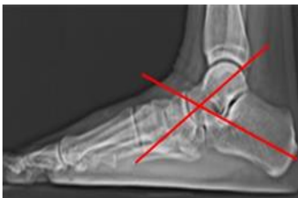
Fig. 4 Method to measure the talocalcaneal angle

Talo calcaneal angle. The angle between the lines that vertically divide the talus and calcaneus in half was measured on a lateral X-ray image to obtain the talocalcaneal angle. The measurements were taken before wearing the foot orthosis (baseline), and at 6- and 12-months (Figure 4).