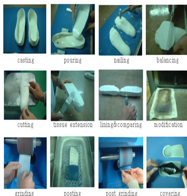
Fig. 2. Producing of foot orthosis

During the study, the participants wore the navicular support orthoses for 8 hours or more per day. RCSP measurements and X-rays were taken without the foot orthoses. To accurately measure the medial longitudinal arch, which measures the tilt of the calcaneus before wearing the foot orthosis, lateral X-rays were taken in the standing position. Using the X-ray image, the talocalcaneal and talometatarsal angles and navicular height were measured. The measurements were taken before wearing the foot orthosis (baseline), and at 6- and 12-months after starting the orthosis intervention.