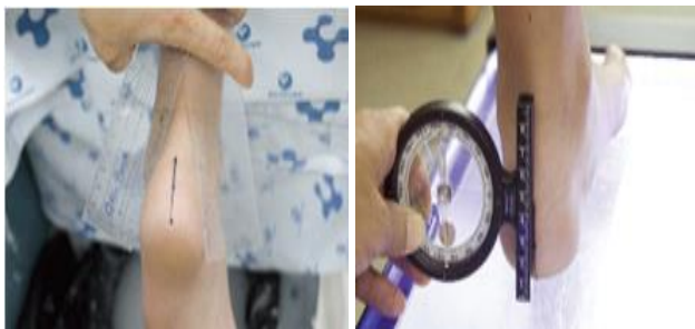
Fig. 3. Method to measure RCSP

Resting calcaneal standing position. For RCSP, a line was drawn to vertically divide the calcaneus in half as the patient was in the prone position without bearing weight on the foot. Next, the angle between the line and the ground in the calcaneal standing position while bearing weight was measured. The measurements were taken before wearing the foot orthosis (baseline), and at 6- and 12-months (Figure 3).