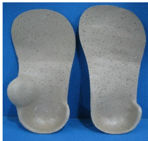
Fig. 1. Navicular support orthoses