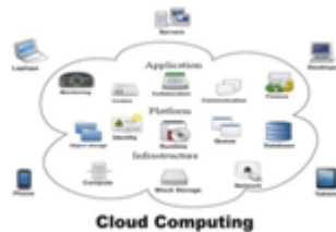
Figure 1: Cloud computing scenario

when information wind up plainly bigger and bigger day by day, cost Of EC2 turn out to be more. The total cost Of the EC2 will more than in-house improvement of extensive database framework [3]. Such issues of the EC2 should be tackled for the huge database framework by Figure:1.