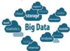
Figure 2: Big Data

MapReduce and its open source usage Hadoop Of Key-esteem Store database framework is generally spread and embraced in industry and the scholarly community. MapReduce programming worldview is exceptionally versatile however extremely hard to utilize. It requires abnormal state of programming aptitude to create code with MapReduce_ Apache Hive[5], Apache Pig, JAQL and so on are arranged into IOW level MapReduce employments. By Figure:2, Other than these there are archive situated databases, segment arranged databases and chart databases additionally famous in industry