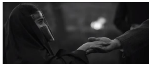
Fig.1 PSA on Child Marriage in South Asia

and emotional message. However, the video does not contain any clips that support the texts that are included in the video. This makes the video somehow looks not properly planned.