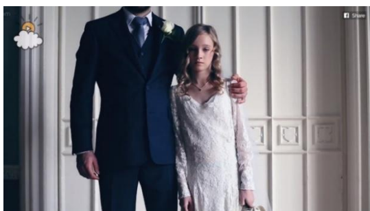
Fig.1 UNICEF's Chilling PSA to End Child Marriage

In this paper has study on three current PSA child marriage that already use outside from Malaysia. However, the video still have limitation. Hence, this paper focus to enhance the current PSA by enhance the content of the video. Fig. 1 shows a PSA brought by the collaboration of UNICEF and Bridal Musings to show the horror of child marriage. In the video, it shows a wedding ceremony and one of the brides is a child aged 15 years old. The video displays a very emotional and strong message behind it. However, there are too little text showed in the video. This may lead to misinterpretation by viewers or maybe some of the viewers may not get the real message behind this video.