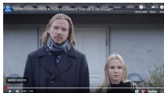
Fig. 3 PSA video by BØRNEfonden (Children and Youth Foundation)

Fig. 3 shows a video made by BØRNEfonden (Children and Youth Foundation) and was published on 22 November 2016. This video highlights the reaction of several families when 30 years old man came at their door and asking to marry their child. The reaction of the parents in the video is what made the video has a very strong and powerful message. However, this video is opened to any kind of interpretation from the viewer and some of them may get the wrong message from the video.