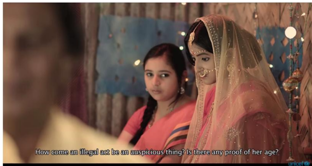
Fig. 4 PSA video footage for child marriage in Bangladesh [17]

Fig. 4. In the campaign [16], they were using all media to spread about the child marriage awareness including using mass media like media, TV, radio and dramas; billboard and social media like Facebook and YouTube.