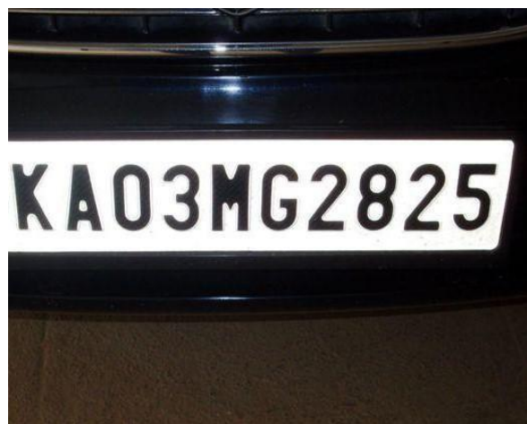
Figure 2: Input image

This input is taken by the camera attached on the door is represented in figure 2.