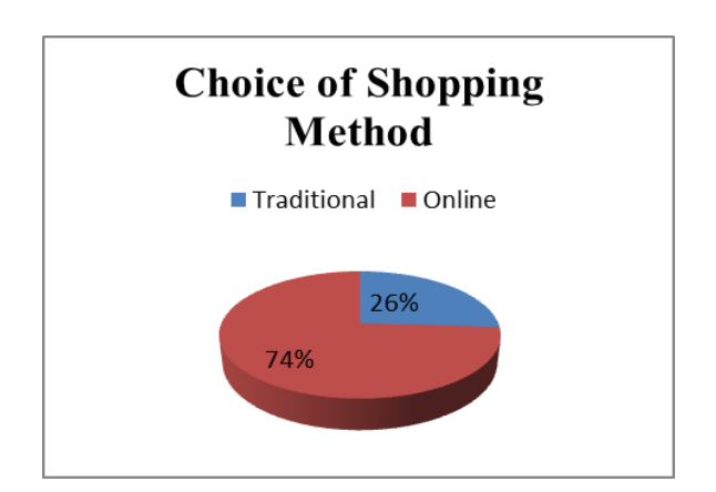
Chart 2: Representing the Choice of Shopping Method