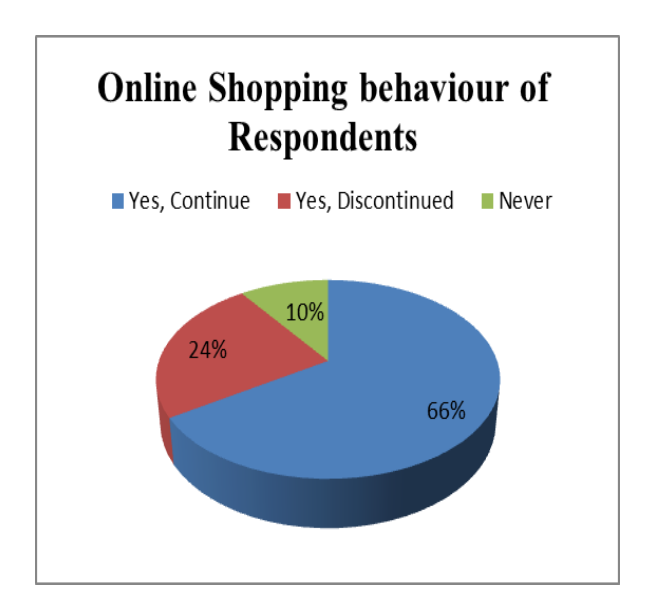
Chart 3: Representing the Online shopping behaviour of Respondents

From Table 3 & Chart 3, we could infer that out the total 250 respondents 66% continue to go with online shopping, whereas 24% previously online shopped discontinued using the method and 10% of respondents never used online method of shopping.