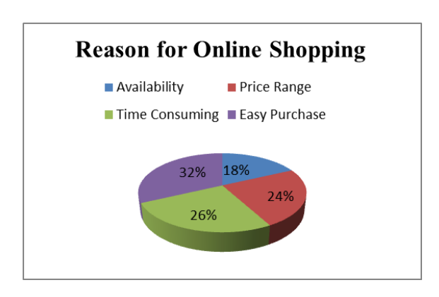
Chart 5: Representing the reason for online Shopping

From Table 5 & Chart 5, we could infer that 32% of the total respondents consider easy purchase as reason for preferring online shopping method, where as 26% states time consuming as their preference the rest 24%