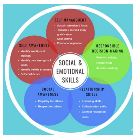
Fig.1:Emotional skill development

The idea of initiative manifests itself in an exceptionally multitude of how, one among that is with peers. In keeping with Erikson, a usually growing nipper is eager to have interaction and play with alternative kids. A child employer lacks initiative, and as an alternative feels a whole lot of guilt, is Hesitant to affix peers in taking component in, and so is a lot of seemingly to be rejected through his friends. For the duration of the instructional institution years, youngsters start to understanding and overtly show an extensive range of emotions. Jealousy, exhilaration, worry, happiness, and anger are feelings a toddler ought to begin to show at this age. At some stage in now, children are step by step even-tempered and cooperative and compliant with their oldsters.