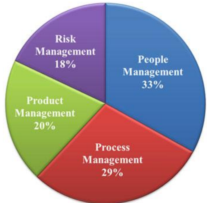
Fig 3. Importance of main software project management areas

expectations are predictable with organizational measures and objectives.