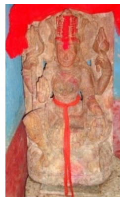
image of Pancha mukhi Hanumana is made of

The deity Mahavir has five heads. In the right side hands, He possesses kalasa , khadga , gada , japamala , and one of hands of right side displays abhaya mudra while the left side hands display trident, ankusa , shield, panapatra and gada respectively. The