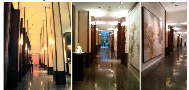
Figure 5. Visual communication after computer image processing.

As the saying goes, "Everything has its own rules to follow". The walkway computer image design of a scenic spot is also very high-end and simple, using a variety of different materials, and using the dividing line to skillfully computer image design a sense of hierarchy. The display items in the corridor are displayed in the way of a museum. Cong Yun "tourist scenic corridor computer image design planning innovation is first in the sense of formation has been strengthened overall. This also includes the enhancement of the concept of clumps and the overall enhancement of the concept of "points, lines and planes". On the one hand, modern art painters pay more attention to the content, form and composition of computer image design, which improves the convenience of communication between customers and service personnel.