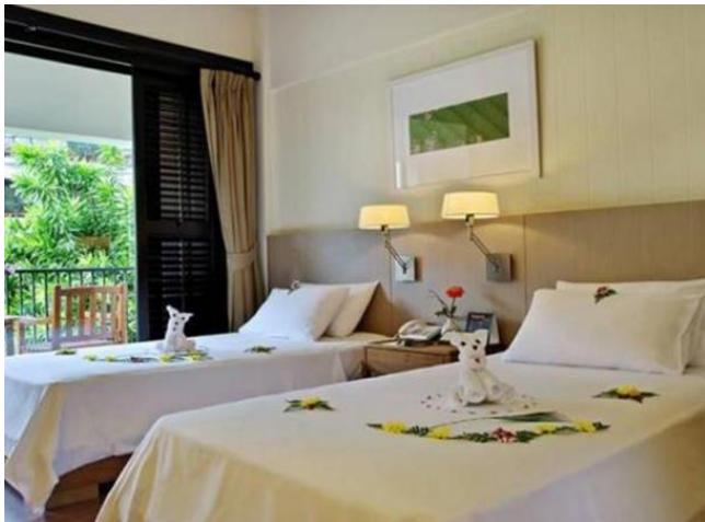
Figure 6. Visual communication application of scenic guest rooms.

Guest room is the most important place for customers to relax and relieve fatigue. Therefore, in the computer image design of this area, the overall visual communication should make people feel relaxed and quiet. Generally, light-colored or warm color computer image design should be chosen.(figure 5)