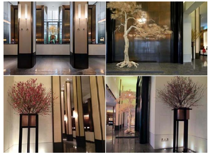
Figure 4. Computer image design combined with visual communication art design.

As the saying goes, "Everything has its own rules to follow". The walkway computer image design of a scenic spot is also very high-end and simple, using a variety of different materials, and using the dividing line to skillfully computer image design a sense of hierarchy. The display items in the corridor are displayed in the way of a museum. Cong Yun "tourist scenic corridor computer image design planning innovation is first in the sense of formation has been strengthened overall. This also includes the enhancement of the concept of clumps and the overall enhancement of the concept of "points, lines and planes". On the one hand, modern art painters pay more attention to the content, form and composition of computer image design, which improves the convenience of communication between customers and service personnel.