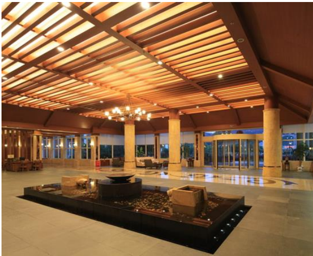
Figure 3. Visual communication scene based on computer image technology.

As the most obvious part of the external space, the color adjustment of the public space needs to create a more positive, warm and harmonious feeling. Therefore, strong color contrast can be used for computer image design to provide customers with certain contrast and surprise.(figure 3)