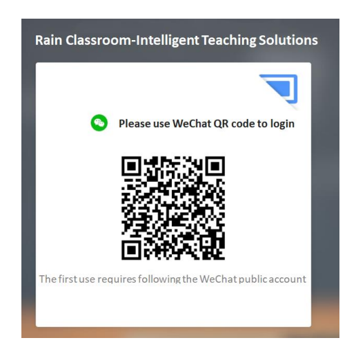
Figure. 1 Rain Classroom login interface

This electronic teaching method was founded by an online studying platform called "School Online" and the online education office of Tsinghua University. At present, there are already 330,000 users in 200,000 classrooms in 114 countries using this teaching software. Rain Classroom has become the most active electronic teaching tool in China. Its purpose is to connect the intelligent terminals of teachers and students in order to maximize the teaching experience of students and thus improve the teaching effect [7]. Rain Classroom integrates complex information technology into PowerPoint and WeChat. By using it, teachers can send pre-study courseware with MOOC videos, tests, and audio to the student's mobile phone and students can give feedback in time [8]. Through Rain Classroom, students can answer questions and send barrage in class, providing a perfect solution for teaching student traditional and interaction. Nevertheless, there is also a shortcoming: it needs to be attached to Microsoft's software PowerPoint to be able to run. However, we believe that for a long time in the future, Microsoft PowerPoint will be the main courseware designing software. Therefore, I believe that Rain Classroom would become more and more popular all over the world in the future.