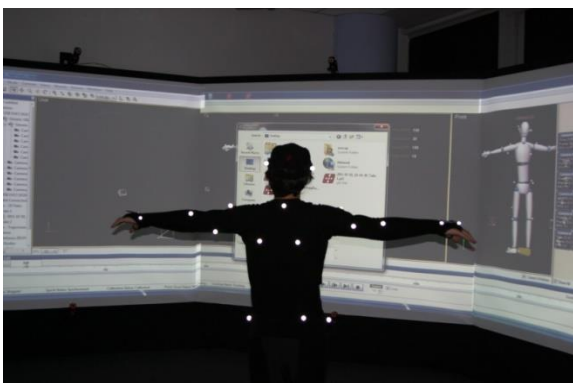
Figure 1. Human detection motion capture

Human detection technology in the past first to achieve the detection of moving objects, commonly used methods include optical flow method and frame difference method and so on, then to analyze and judge according to the prospect that, according to the various parts of the body and the proportion of the shape or color of the skin is to analyze the characteristics of the underlying image matching, so as to human body target and non target classification. This kind of traditional detection method is not ideal in the complex external environment and the outside object occlusion interference, and it is also vulnerable to the influence of the bottom image characteristic noise. The target tracking is called the target tracking by monitoring the detected target, analyzing and predicting its trajectory, and then tracking the target of interest. Human body tracking is usually based on feature, contour and other methods.