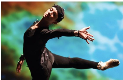
Figure 4. Comparison of dance movements

The system construction needs to solve the development environment of Kinect first, and the development tools of this system must be built in the visual and Java development environment. The network method of man-machine interactive system and user interface of the system is based on Socket network transmission, and network through the wireless network address; human-computer interaction system mainly in the notebook computer platform, and through the skeleton detection results of Kinect transmission of information to the user interface system for the transmission of information system operation, through the coordinate location map orientation the real-time tracking of user interface system in this system the position real-time display coordinates information back to the user interface and the user interface to the main system; user interface platform for information transmission and reception, and transmission through the wireless network control chip. The network transmission process of this system can be transmitted to the user interface system through the requirements of man-machine interaction system, and the information received by the system is controlled by the server in the wireless transmission.