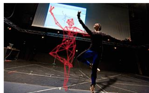
Figure 3. Acquisition of motion data

The dancers perform the dance movements before Kinect, and the dancer's movements are captured by Kinect in real time. After the occlusion points are repaired, the trainers' motion data are obtained. Finally, the obtained trainer motion data is compared with standard motion data. In the process of teaching production and development, it is necessary to continuously collect relevant data to evaluate the teaching content and structure continuously, which is in line with the teaching needs. This research is evaluated according to three aspects: teaching content, teaching design and user interface design. The survey is carried out in two stages, the first stage is to implement expert evaluation, to revise inappropriate teaching content and teaching plan, and the second stage is to evaluate the students and teachers, in order to understand the advantages and disadvantages of teaching design and development as the basis of teaching improvement.